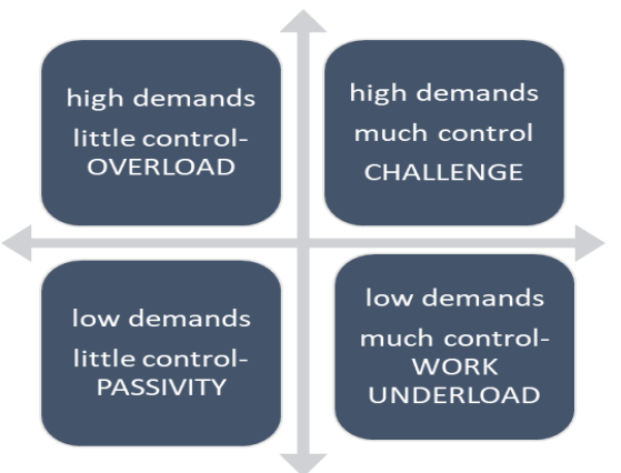
Figure 1. Demand-control model