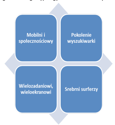
Figure 3. Google typology-based on user experience

Generation may be also classified on the basis of age, experience and abilities of people. Habits of people from particular generations differ significantly depending on their age and experience which was presented in Google barometer (typology: Barometr konsumencki Google) (Figure 3).